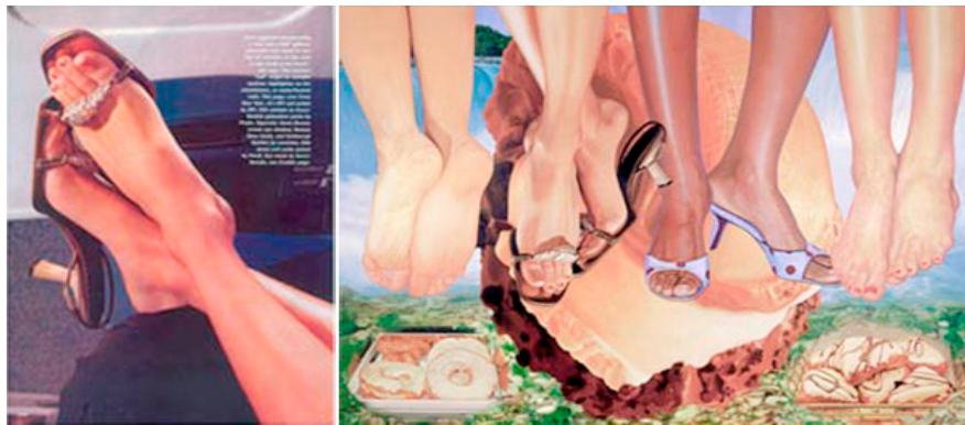
Figure 9: Allure magazine is shown on the left, while Koon's collage is shown on the right.

understanding subtle artistic messages.” 134 Koons has altered is artistic expression to avoid legal liability. Unfortunately, he continues to be harassed with persistent litigation. Koons’ success has made him a target for unpredictable copyright lawsuits. His work is “the most original, controversial, and expensive American artist of the past three and a half decades.” 135 He elicits controversy because he appropriates cultural images, while the potential for a big settlement entices frequent lawsuits. For instance, in December of 2014, Koons received two lawsuits within a couple weeks of each other: 136 one for his work “Fair d’Hiver” for resembling a French advertisement, and another for his sculpture “Naked” for resembling a photographer’s photo. 137 Koons was sued yet again in 2015 for alleged copyright infringement in his painting that resembled a photographer’s gin ad of a couple on a beach with an easel. 138 The frequency of these suits and “[t]he disparate results of [Koons’] cases, not to mention the high costs of litigating against a back-drop of uncertainty, help explain why a climate of “self-censorship” has taken hold in the art world.” 139