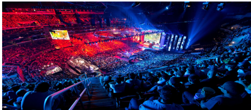
Figure 7: A stadium filled to watch professional gamers play an Esport.

These “Lets Play” videos are 100% fan generated content. Like the attorney in the seminal DEFENDER case argued, the player is in a sense an author. 90 When fans watch professional eSports, it is not to admire the programmer’s copyrighted work, it is to watch the professional in action, to see what they author in a live setting. Fans watch to take note of the strategies they employ, what decisions they make, and how the pros overcome adversity from their opponents. That is what fills the stadiums for eSports events. Streaming video games gives a unique insight into the interworkings of someone’s mind. It is more than just standing side by side with a friend watching an event unfold. You enter their frame of reference, you see exactly what they see, a perfect replica. You follow their every step as they engage a challenge. You can critique or admire their every reaction to an adverse situation. You can see their problem-solving capabilities in action every second