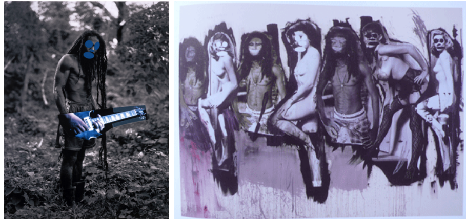
Figure 9: Both images are Prince's artwork. The left image was modified by adding a guitar and face decoration, while the right image incorporated both rastafarian's and girls into a collage.

The punishments for copyright infringement are destruction and censorship. They make an injunction look harmless, and yet the Supreme Court has advised that “[i]n exercising their sound discretion, courts of equity should pay particular regard for the public consequences in employing the extraordinary remedy of injunction.” 147 If an injunction is extraordinary, then what is book burning and destruction of art? Destruction like this, in the form of deletion or erasure, is what happens when YouTube videos, fan games, and legacy servers are removed from the Internet. These punishments are more than extraordinary, and the victims are not the only affected communities, but the public at large who experiences a diminishment in the amount of available content in the public domain.