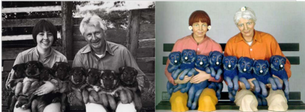
Figure 2: On the left is the post card Koons used to create the sculpture shown on the right.