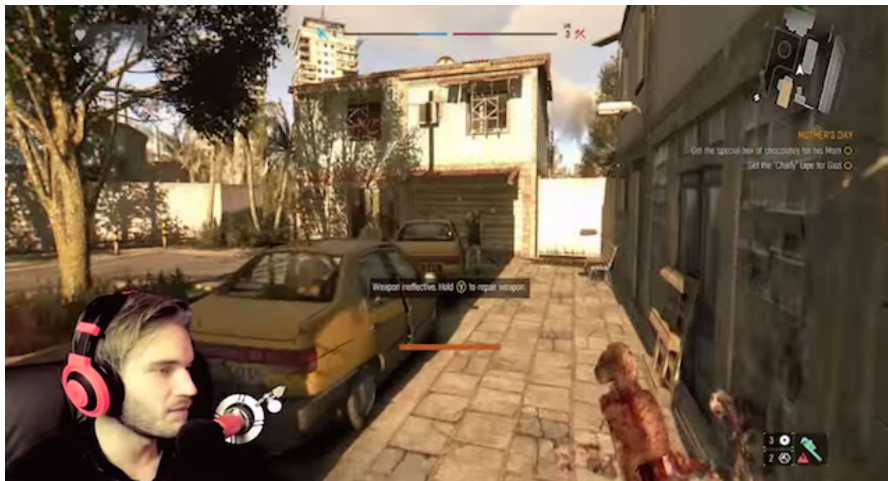
Figure 8: "Lets Play" YouTuber PewPieDie streams himself playing and commenting on a videogame.

Analyzing strategy is one reason you could watch someone play a video game, but why would you want to watch someone else play a video game? This question perplexed media outlets when Amazon acquired Twitch.com for $1 Billion dollars in 2014. 91 The allure of watching someone else play a video game has been analogized to watching the performance of a professional actor. 92 One such performer is named PewPieDie, a streamer who shares stories, tells jokes, and generally overreacts to the game he is playing to the appeasement of his fans. 93 People really like to watch this stuff, so much so that his YouTube royalties exceed $12 million a year. 94 An image of his streaming feed can be seen below.