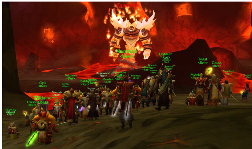
Figure 5: The guild “Ret” preparing to fight the last boss in the Molten Core raid, Ragnaros, from the Original version of World of Warcraft.

So, what is the big deal? To illustrate the issue that compelled fans to revive the original World of Warcraft, it is helpful to consider a recent class action filed against Electronic Arts (“EA”). 73 EA offered an online game called Simcity. In Simcity the player is appointed mayor of an empty tract of land. By building roads, providing water and electricity, and zoning areas as residential or commercial, NPCs (non-player characters) called “Sims” start to move onto the tract of land. These Sims then build houses and commercial businesses. After many hours of play, a city begins to form. To make the game easier, EA offered in-game purchases. Players could purchase in-game currency or special buildings. The problem is that after the players invested not only their time but also real money into this virtual world, EA shut down the servers. This prompted a class action suit against EA. 74