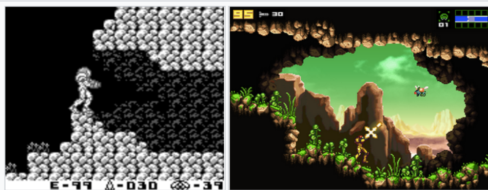
Figure 1: The original Metroid 2 is shown on the left, while Project AM2R on the right shows the same section of the game

The Metroid series began in 1986 and has sold 17 million game copies as of 2012. 36 Project AM2R is based on “Metroid 2: The Return of Samus,” which was released in 1991. In the game, players take control of space-faring bounty hunter Samus Aran. She is on a mission to eradicate fast evolving, parasitic metroids. The game combined the platform style of “Super Mario Bros.” with the exploratory, non-linear style of “The Legend of Zelda” series.