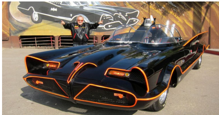
Figure 6: Towle's Batmobile replica.

The revival type of fan participation is an emerging activity. The revival is a direct response to the nature of online gaming because gameplay requires a server to be hosted by somebody. The closest analogous case is DC Comics v. Towle , where a fan created fully functional Batmobiles from the old TV show and sold them. 80